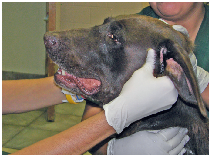
After the cleaning solution has been placed in the ear canal, use your right hand to gently massage the outer part of the ear canal. It is just forward of the ear opening (shown where the right thumb is, here).